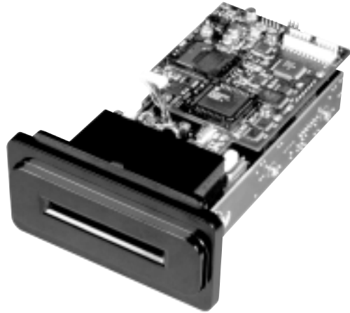
Shown with D Bezel